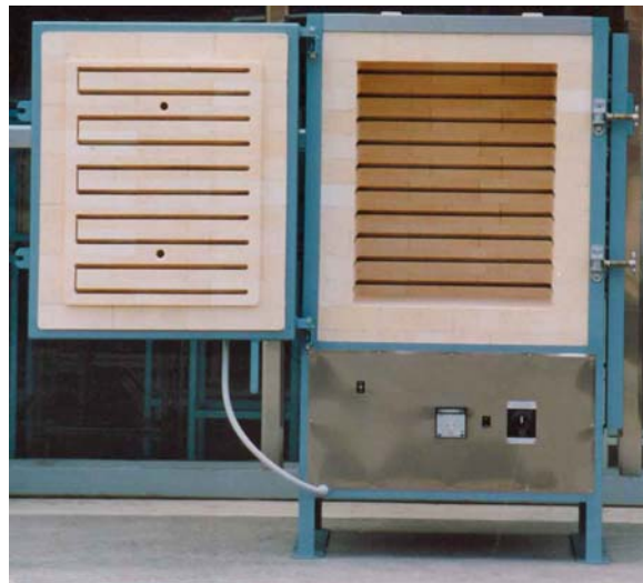
K11A FRONT LOADER

www.northcotepottery.com.au npsupplies@bigpond.com (PH) 9387 3911 (FAX) 9387 4011