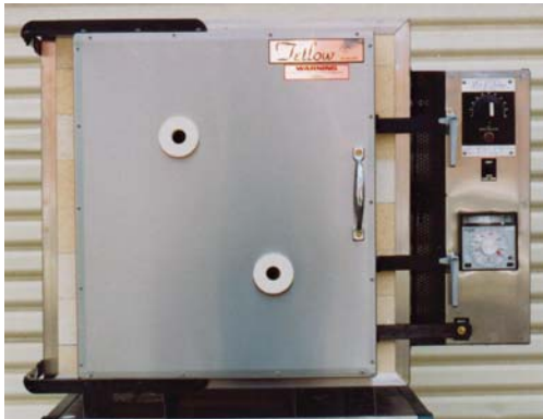
K6 FRONT LOADER